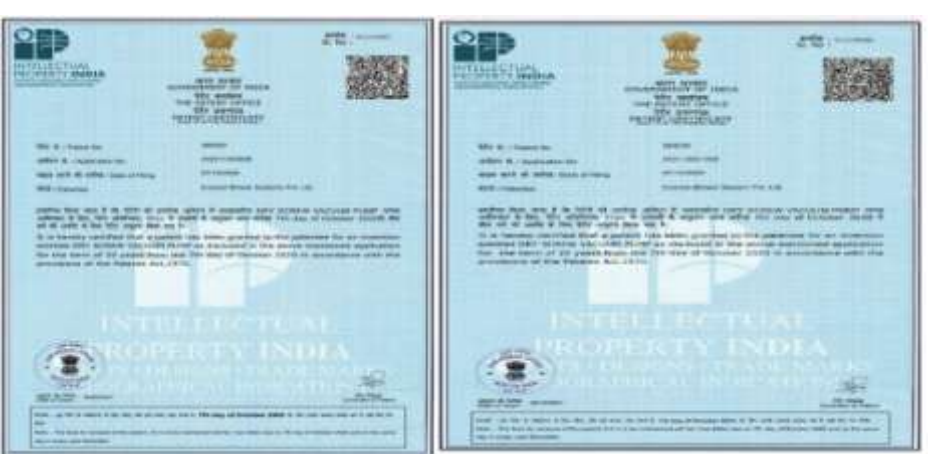
Fig 3: Patents granted to Everest Vacuum on Dry Screw Vacuum pumps Further, we have been granted Design Protection (Fig 4) for the Dry Screw Vacuum pump.