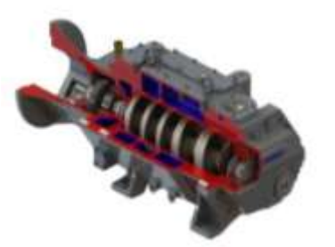
Fig 1: Everest Dry Screw Vacuum pump (Superscrew series)

Superscrew is the newest development in the vacuum pump industry (Fig 1). They offer a number of advantages over traditional vacuum pump designs. There is No Oil / No Water in contact with the process vapors, therefore they are considered as extremely environment-friendly. As these pumps are completely dry, the process vapor can pass through the pump without any contamination and be collected at the discharge of the system by a vent condenser. This offers the customer a very efficient vapor recovery management system and an environment friendly vacuum ecosystem.